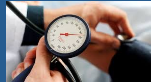
Physical Health and Care