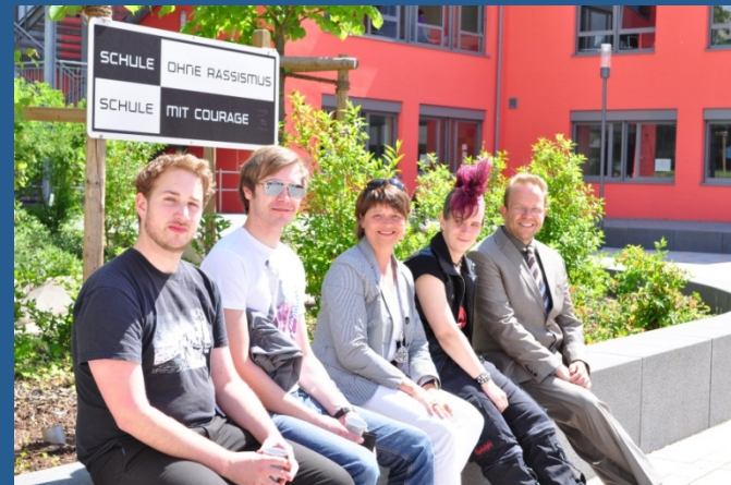
headmaster with students